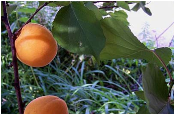
Ann Arbor apricots