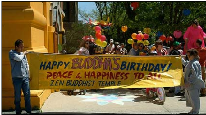
Steppin' out from Cornelia Avenue