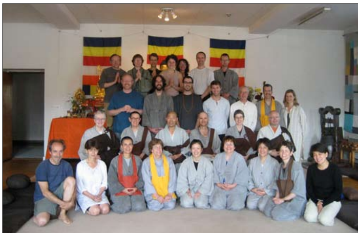
Summer Yongmaeng Chongjin participants in Toronto